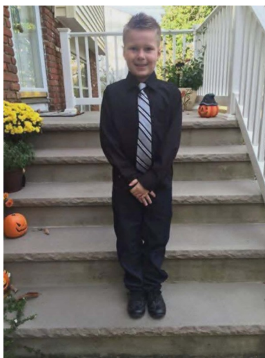
TWIN RIVERS HIGH