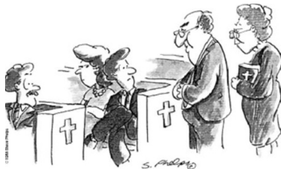
The whole church watched with nervous anticipation as the visitors sat where the Martins have sat for 42 years.