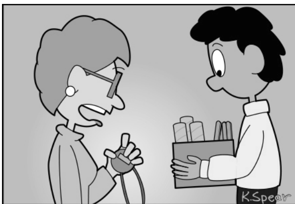
"Okay! You have some petroleum jelly, popsicle sticks and several TP rolls. You have ten seconds to make a spiritually meaningful craft. GO! "

INSTRUCT ENCOURAGE PRAISE INFLUENCE SHARE GUIDE INSPIRE